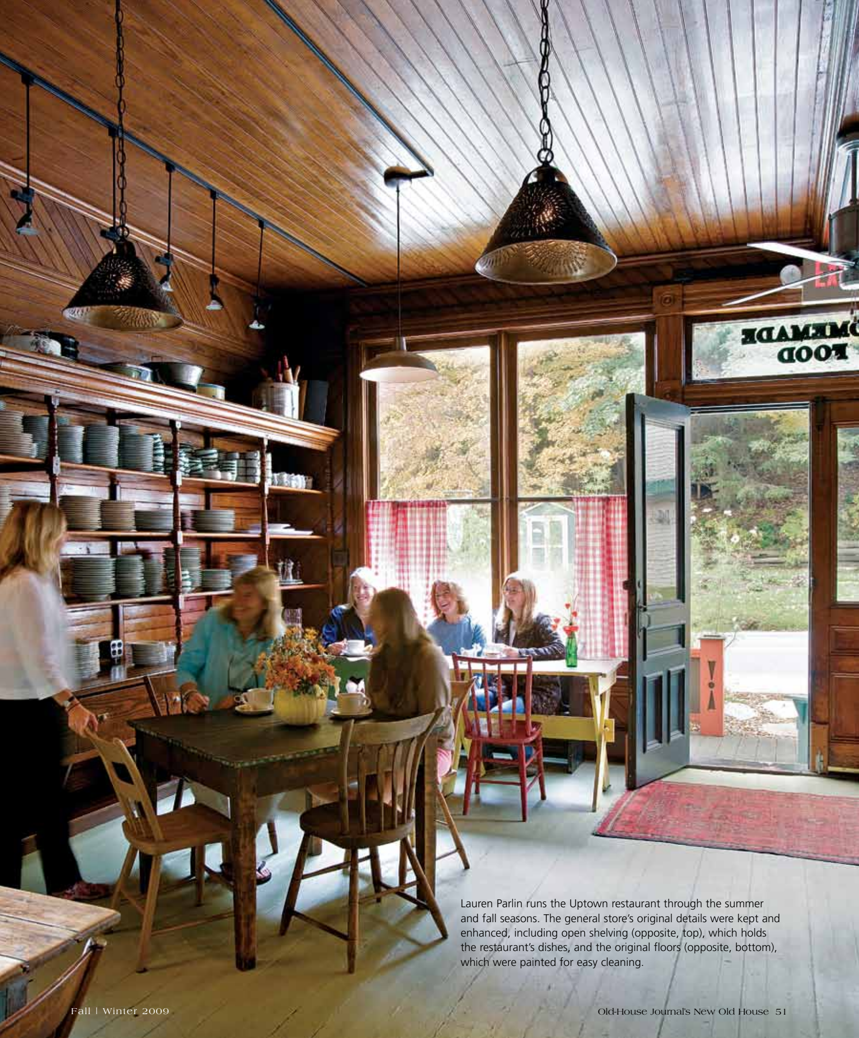
Lauren Parlin runs the Uptown restaurant through the summer and fall seasons. The general store's original details were kept and enhanced, including open shelving (opposite, top), which holds the restaurant's dishes, and the original floors (opposite, bottom), which were painted for easy cleaning.